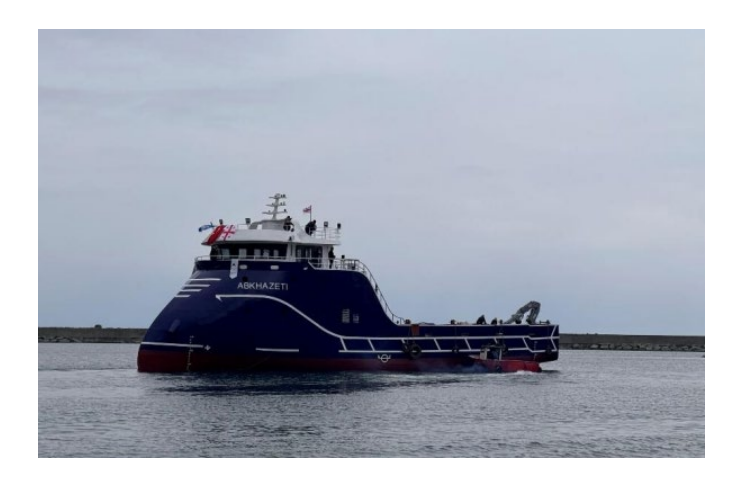
New Georgian hydrographic vessel ABKHAZETI, 34m

• <u>Bulgaria</u>: lack of personnel to be sent to the IHO-sponsored Cat A and Cat B courses on Hydrography and Nautical Carthography;