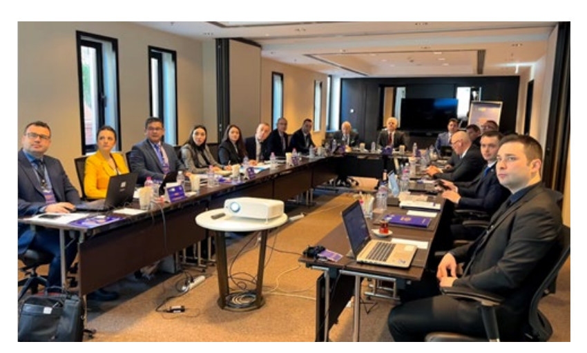
Discussions at the 17th Black and Azov Sea Working Group

The IHO Director highlighted that a long time has passed since the last in-person meeting held in Constanta (Romania) in May 2018. From that time, new challenges await the WG, first of all, the implementation of the S-100 standard, which is now a reality that will become effective from 1<sup>st</sup> January 2026. By that date, the entire community of the Mediterranean and Black Sea Region will have to be ready in line with the S-100 implementation roadmap prepared by the IHO and thanks to the support of all the stakeholders working in support of the S-100. The Working Group allows the six Countries to highlight peculiarities and needs of a specific Region, the Black and Azov Sea, of high interest not only for the IHO, but also for other international organizations working on the sea and for the sea, in such difficult time which the Black and Azov Sea Region and especially the State of Ukraine are living. Furthermore, he highlighted the main cooperation activities undertaken by the IHO internationally and with IHO Member States, the most important outcomes of C-7, with particular focus on the implementation of S-100 Roadmap, Capacity Building and the revision of the IHO Strategic Plan.