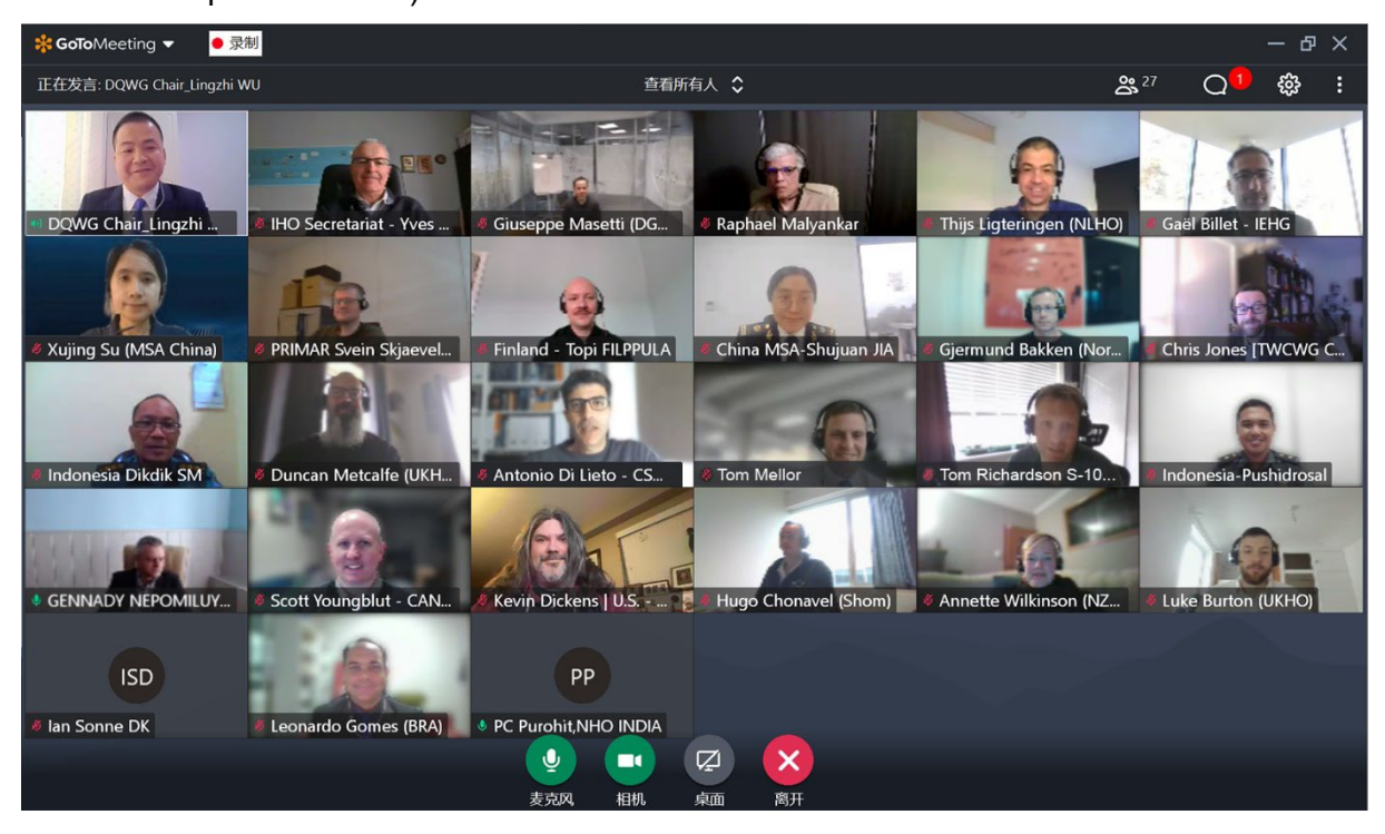
Participants in the DQWG-19 VTC Meeting

The participants welcomed the provisional offer from the Chair of the DQWG to host the next meeting from 11 to 13 March 2025 in China (dates, location and venue to be confirmed no later than September 2024).