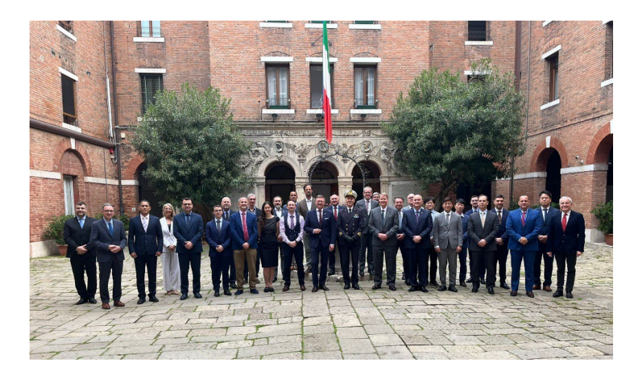
Participants in HCA-19, in-person and VTC