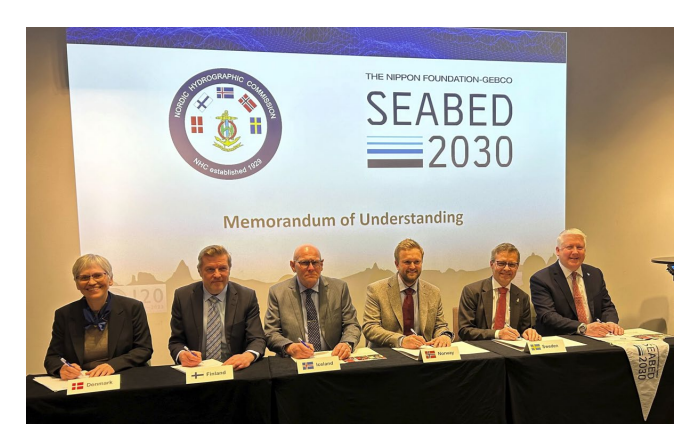
NHC Signing the Seabed 2030 MOU

collaboration was reconfirmed and the NHC appears to be well positioned to successfully implement S-100 products and services in accordance with IHO timelines. Strategic areas of interest included production, distribution, and security.