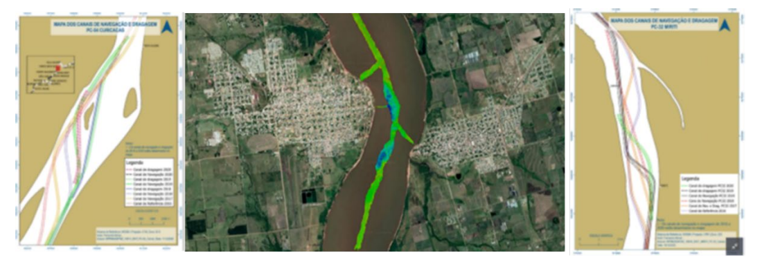
Waterways surveys in SWAtHC

The Regional Capacity Building Coordinator reported on the most recent CB activities, the current status of the IHO e-learning centre and the IHO-CANADA Empowering Women in Hydrography (EWH) project within the Region, highlighting the excellent support that the HOs regularly receive from the industry in building hydrographic capacities at national and regional level. A request has been submitted to IC-ENC for the provision of funds to support CB phase 3 projects, including conversion from S-57 to S-101 and production of ENC and S-100 products. The activities will be submitted to IC-ENC to eventually be approved and financed by the IC-ENC "opt-in funds". Special mention was made of the workshop on the conversion from S-57 to S-101 held at the IHO-Singapore Laboratory in November 2023, which was attended by representatives of the Hydrographic Services of Argentina and Uruguay. Following the report on the last WWNWS meeting, Argentina, as NAVAREA VI coordinator highlighted the problem of the dual system (NAVTEX and IRIDIUM SafetyCast) to be used in the dissemination of MSI. At regional level, it was decided to initiate coordination actions between Brazil and Argentina to evaluate the transmission of safety information through IRIDIUM SafetyCast. Spain, as NAVAREA III coordinator, offered technical solutions for the deployment of the new IRIDIUM SafetyCast system.