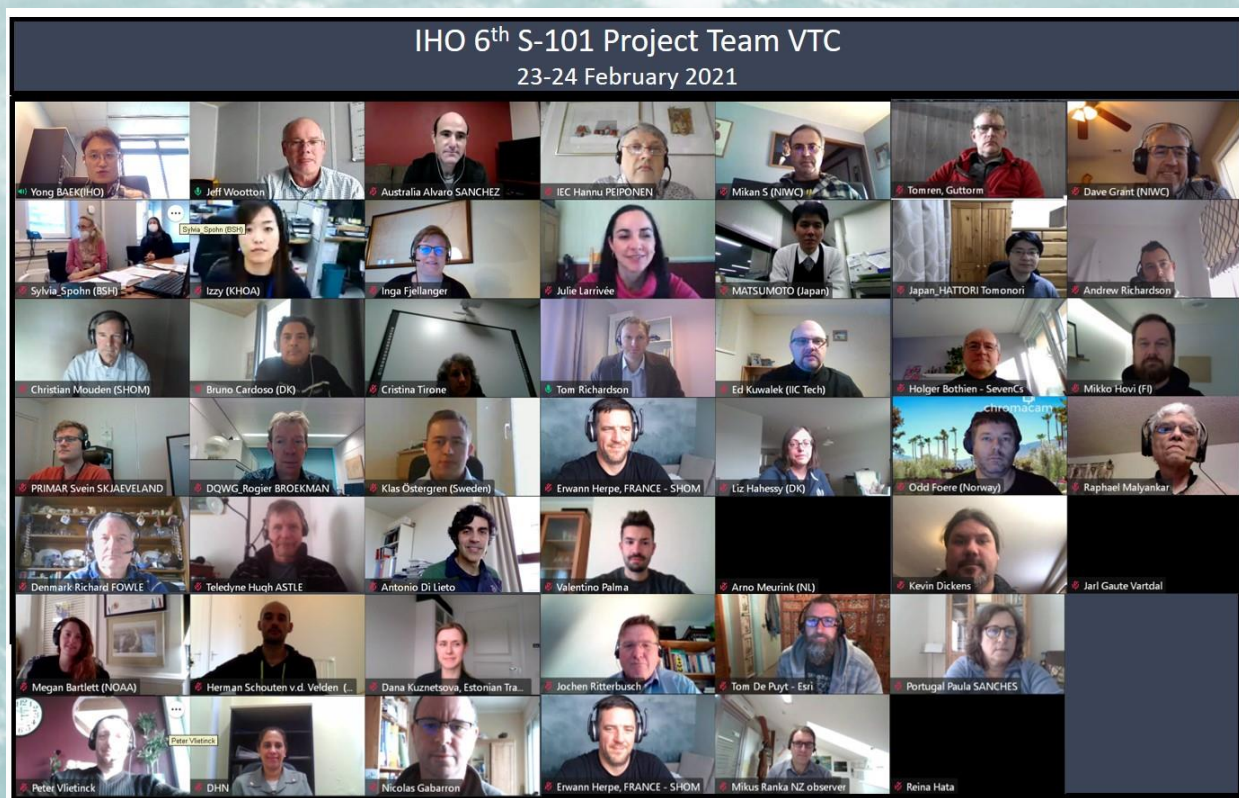
Some participants in the S-101PT6 remote meeting

It was agreed that topic-specific S-101PT meetings may be held as required to discuss and progress emerging or ongoing S-101 issues. Pending impacts of the ongoing COVID-19 situation, it is intended to convene a full S-101PT meeting in November 2021, to be hosted by New Zealand and possibly in conjunction with a meeting of the IHO ENC Maintenance Working Group (ENCWG).