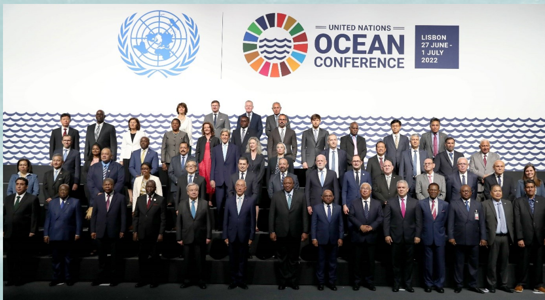
Participants at the UN Ocean Conference

hydrography. Work will not start until 2023, but will entail coordinating a literature review, helping to convene a dedicated workshop and otherwise supporting the OECD team with the provision of subject matter expertise. The intention is that the report will be launched at the next UN Ocean Conference that President Macron has committed to host.