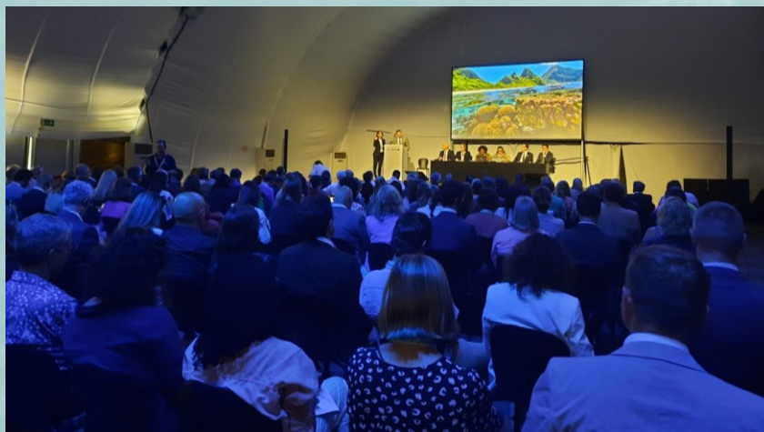
The IHO side-event on seabed mapping.

The event was well attended and the room was at capacity.