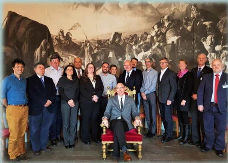
Participants of the 5 th meeting of the HSSC HSPT in Stockholm, Sweden

The meeting was spent reviewing the feedback and comments received from the HSPT members engaged on the draft 6 th Edition of S-44. The entire publication was reviewed and the final text and content agreed in preparation for formal submission to HSSC12 in May 2020. The meeting also considered whether there was a need for a permanent Hydrographic Surveys Working Group (HSWG) and what were appropriate tasks to be