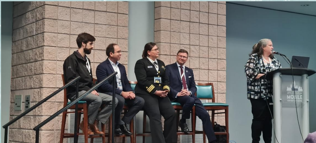
Panellists discussing aspects of “The hydrographer of the future”