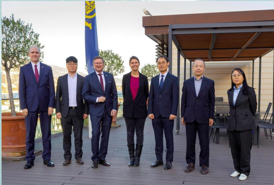
S-130PT6 in-person participants

The next meeting of the S-130PT (S-130PT7) will be held on 5 February as a remote (VTC) meeting.