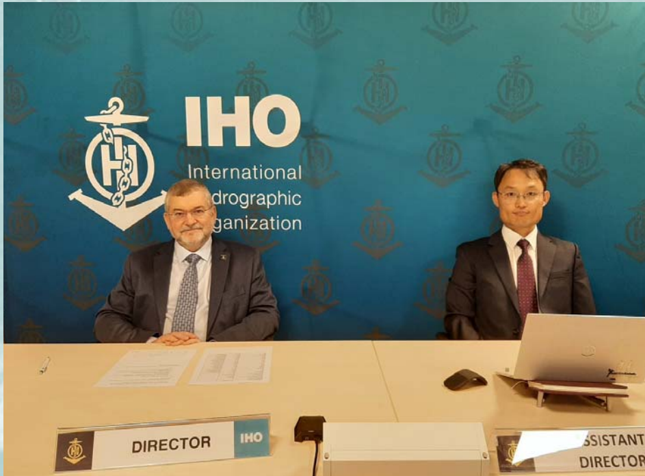
Webinar of the IHO’s S-100 framework: an all-embarcing data model.

ocean with Electronic Nautical Charts and can superimpose information on currents, marine protected areas, weather etc. “S-100 allows users to combine, superimpose and amend geoinformation seamlessly in one solution”.