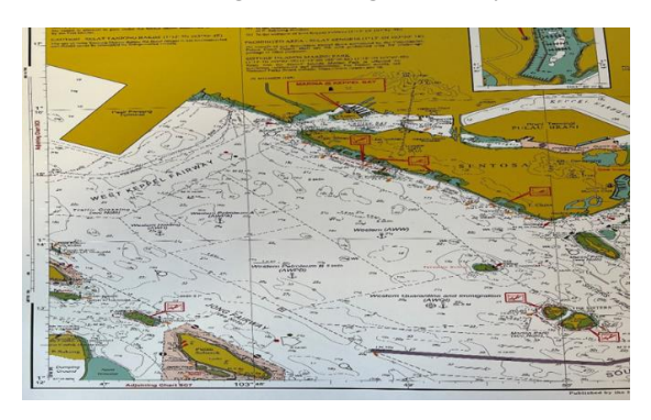
<u>Propose Testbed Area – Jong Fairway, Singapore</u>

The testing is planned for April of 2023 and aims to test the feasibility of updating navigational information using S-124 and S-125 services, as well as the process of transferring data between these different data services as the information goes through its lifecycle.