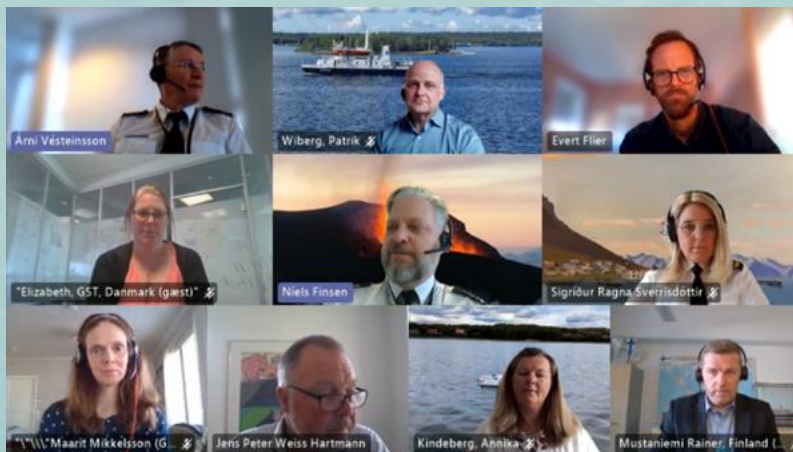
Some participants at the NHC64 Meeting