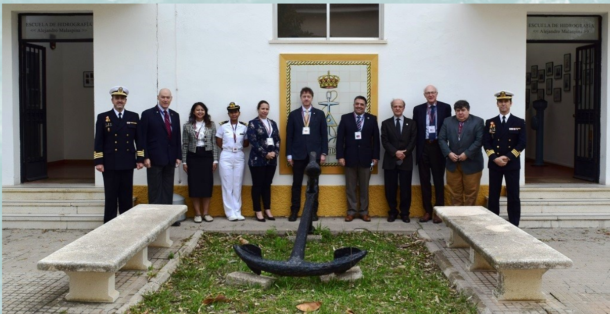
The IBSC Members with the Vice-Director of the IHM and the Director of the School and the interns of the EWH project at the IBSC45

In accordance with the Joint IHO-Canada Empowering Women in Hydrography Project (EWH), in the first week of the meeting, three interns of the EWH-IBSC internship participated in-person at the IBSC45 meeting. All the interns work in institutions with IBSC recognized programmes. During the Internship, they received some training in the submissions' review process and provided a presentation to the Board on the respective findings. The level of their participation in the discussions of the Board related with the submissions was intense, providing relevant contributions that proved the important impact of this project to an eventual collaboration in a future submission preparation from the respective institutions. The Board appreciated the presence and the collaboration of the interns and invited them to also provide comments on the Guidelines in order to have an opinion from an external perspective. They provided a presentation on this topic, highlighting several recommendations and comments. After this successful project, the Members stated their interest in having other internships in the next meetings.