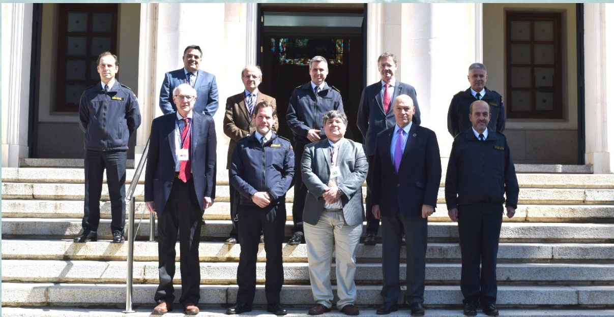
The IBSC Members present in Cádiz with the Director of the IHM and his staff

During the meeting it was also necessary to discuss and approve other important working items such as the Board Work Programme and establish a list of priority Institutions to be visited when the situation allows. Due to the need to increase the number of members of the Board, the IBSC will propose to IRCC a new version of the Terms of Reference to include two additional members from ICA.