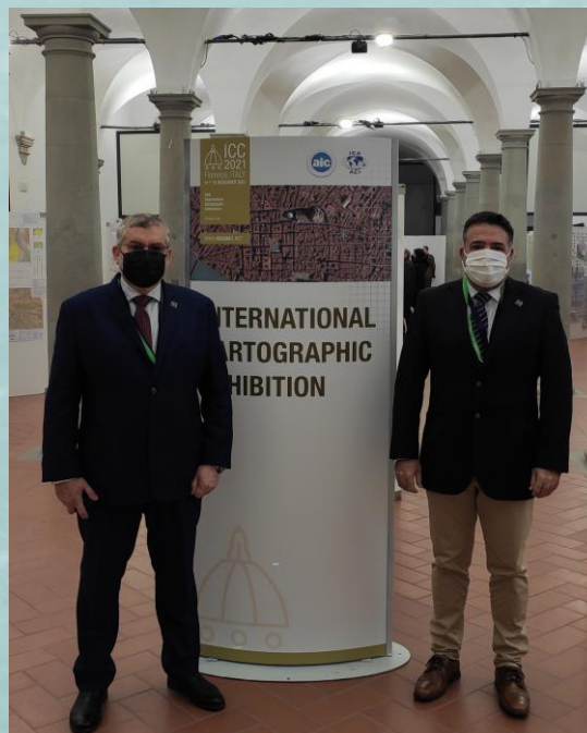
The IHO Delegation at the Cartographic Exhibition.

The ICC 2021 consisted of the Conference, where numerous scientific papers on cartography-related matters were presented throughout the week in sessions running in parallel and a Cartographic Exhibition, where various maps and other cartographic products from ICA member countries were presented with several examples of Nautical Charts. The documents of the Cartographic Exhibition in the Virtual Exhibition and the ones physically displayed can be seen on: http://www.geografia-applicata.it/icc-2021-virtual-exhibition/