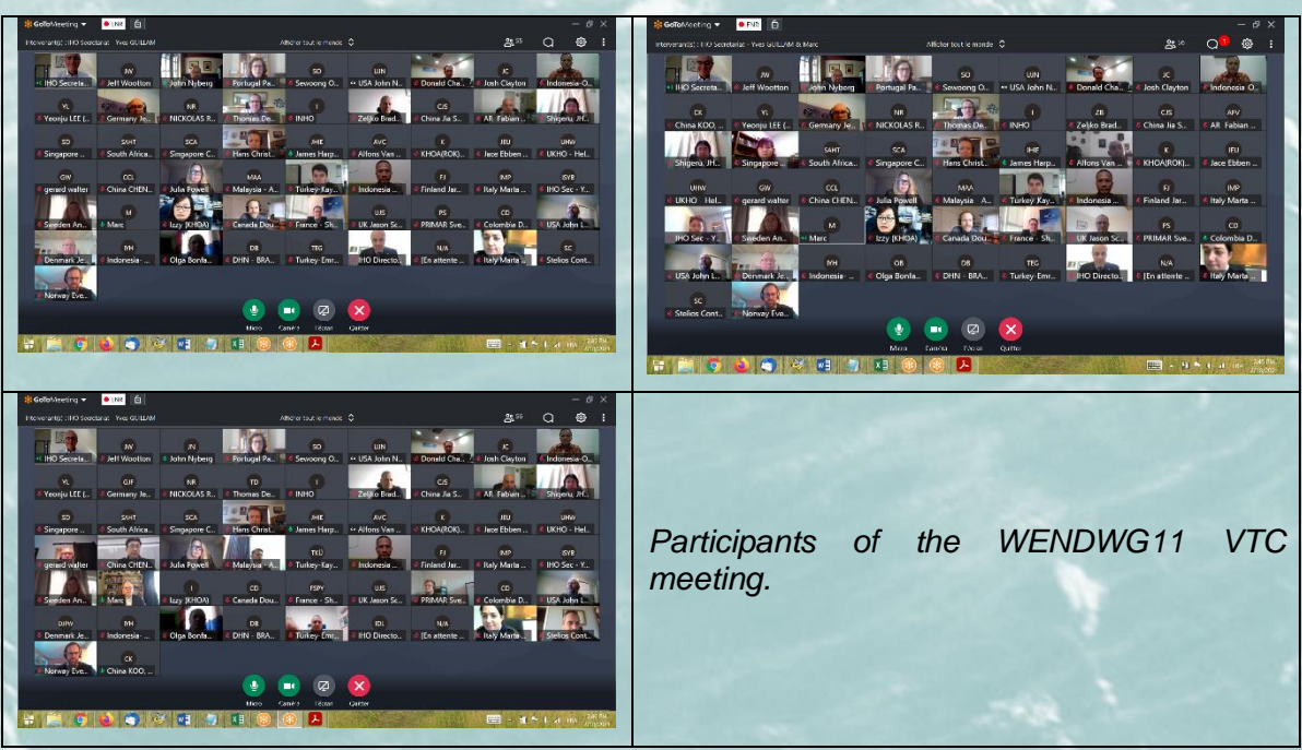
Participants of the WENDWG11 VTC meeting.