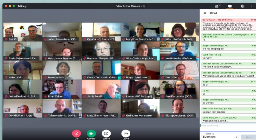
Some of the 43 participants connected for the CSBWG9 remote meeting.