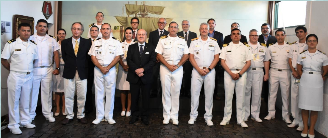
Participants of the SWAtHC14 meeting.