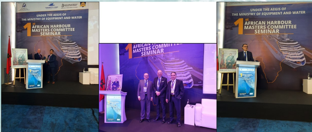
1 st edition of AHMC Seminar official opening

The seminar then developed into the following four thematic panels: