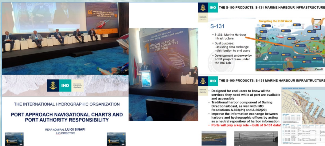
1 st edition of AHMC Seminar 1 st Panel on Navigation - Presentation by IHO Director Luigi Sinapi

IHO Director Luigi Sinapi participated in the 1 st Panel on “ Port approach navigational charts and port authority responsibility ”, highlighting the implementation of a new and universally recognized way of representing the marine environment: the Universal Hydrographic Data Model S-100. The S-100 development concept allows interoperability with a wide range of marine geo-data, and overcomes deficiencies for future digital nautical chart data products. With the approval of the new IMO ECDIS Performance Standards (Resolution MSC.530(106)) the S-100 ECDIS will be legal to use after 1 January 2026 and from 1 January 2029 new systems must comply with the new IMO Resolution on ECDIS Performance Standards (MSC.530(106)).