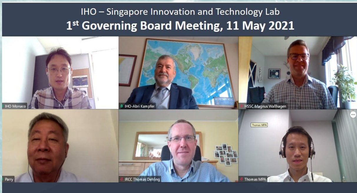
Participants of 1 st Governing Board Meeting