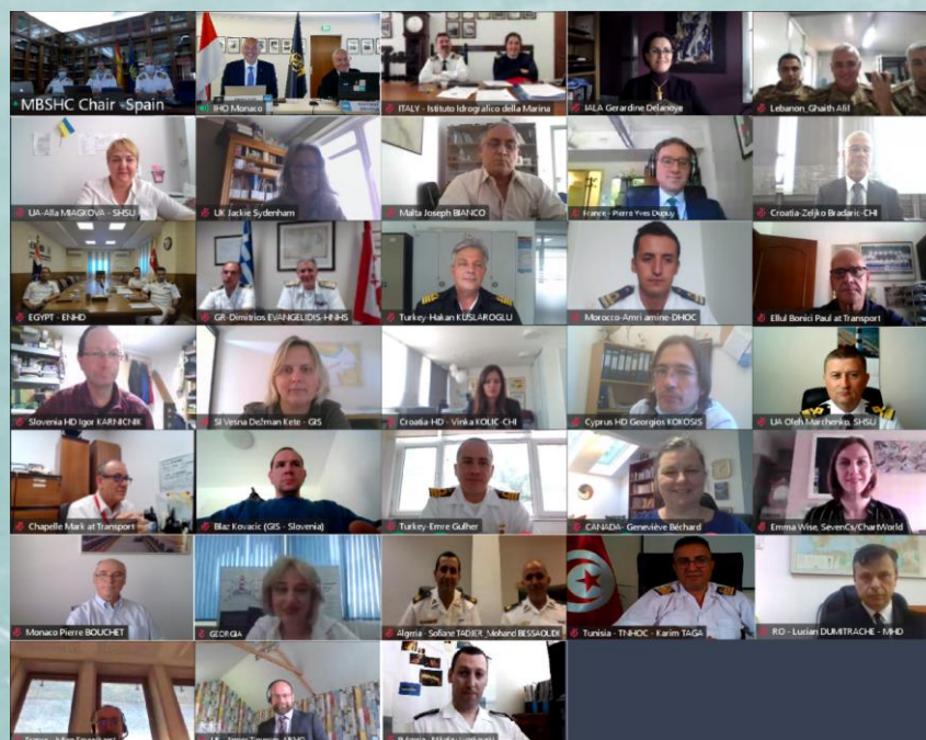
Some of the participants of the virtual 22 nd Conference of the MBSHC.