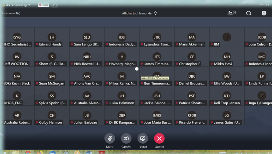
Virtual coffee break for the NCWG-6 participants ☕...

As part of the outcome of HSSC-12, the Chair also drew the attention of the meeting to a paper submitted by Canada promoting the idea of a subscription digital service by which mariners may receive updates in pdf format to their paper charts rather than the traditional Notices to Mariners services that were considered much less efficient. The meeting agreed that further investigations and complementary detailed information were needed to be provided by Canada before the NCWG can consider proposing amendments to the B-600 (Chart Maintenance) section of S-4.