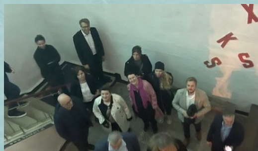
Team PRIMAR on Tour

PRIMAR highlighted progress on its e-learning package which offers courses on ENC production support, PRIMAR business operations, benefits of S-100, and many additional practical exercises to support S-100 products and services. PRIMAR is also considering how to offer this training platform to support capacity building.