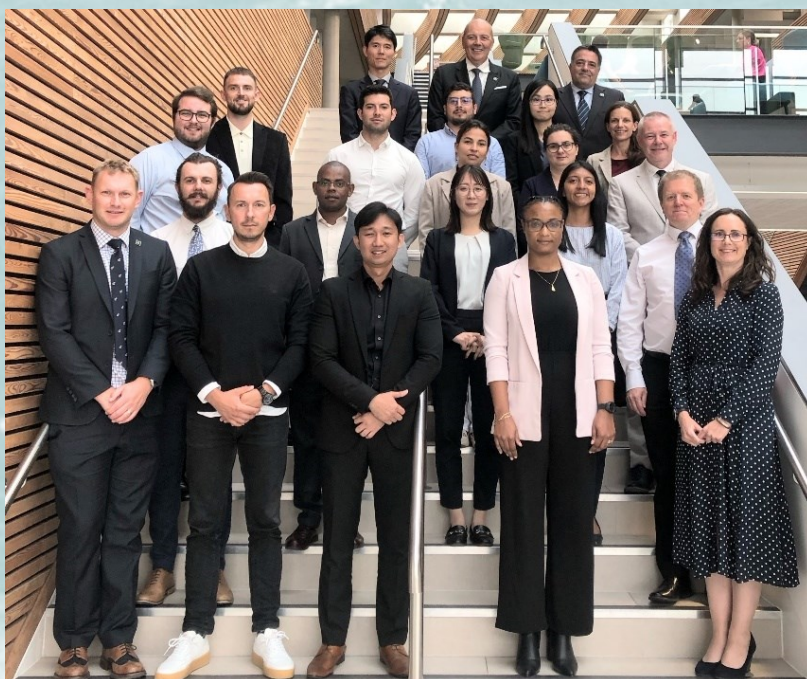
The trainers and trainees of the 15 th GEOMAC Course with the IHO visiting Team.