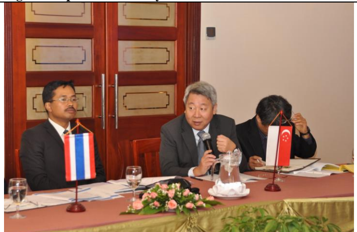
Figure 6 Opinion shared by Chief Hydrographer of Singapore