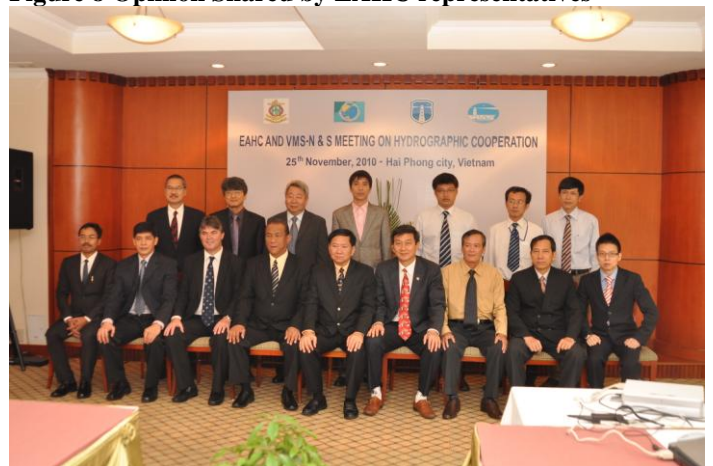
Figure 10 Group photo of the participants

Day 2: Ha Long Bay visit supported by VMS-N and VMS-S.