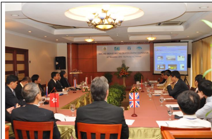
Figure 1 Presentation given by VMS-N

Day 1: The meeting was held at Nam Cuong Hotel, Hai Phong City. Participants were from VMS-N, VMS-S, and the EAHC member states.