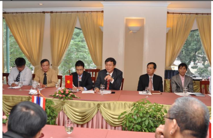
Figure 4 Opinion shared by VMS-N Director General