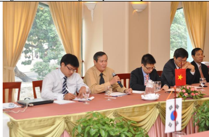
Figure 5 Opinion shared by VMS-S Deputy Director General