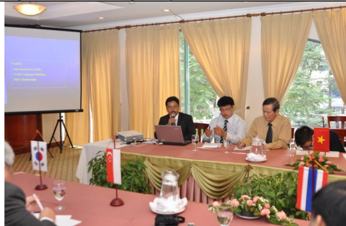
Figure 3 Presentation given by EAHC representative