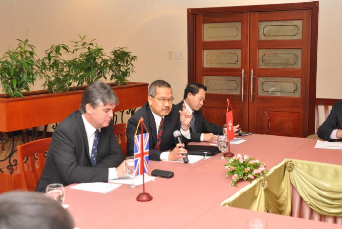
Figure 7 Opinion shared by Hong Kong Hydrographer