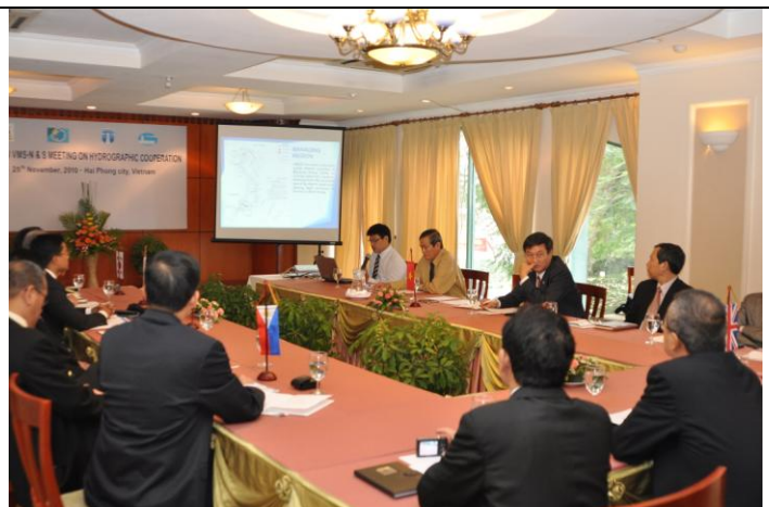
Figure 2 Presentation given by VMS-S