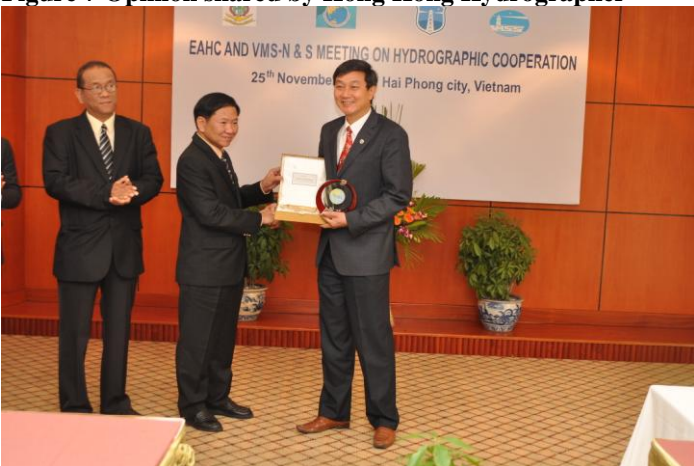
Figure 9 Commemorative plaque and souvenir presented by the EAHC Chairman to the VMS-N Director General