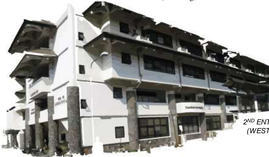
2 ND ENTRANCE (WEST WING)