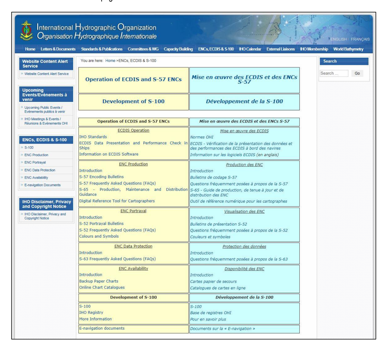
Fig2. New IHO ENCs, ECDIS & S-100 webpage

Working with the IHB since HSSC 8 the ENCs, ECDIS and S-100 webpage has been restructured. The page now lists the data in order of importance to the user starting with the status of IHO standards and moving down to S-100 t the bottom of the page.