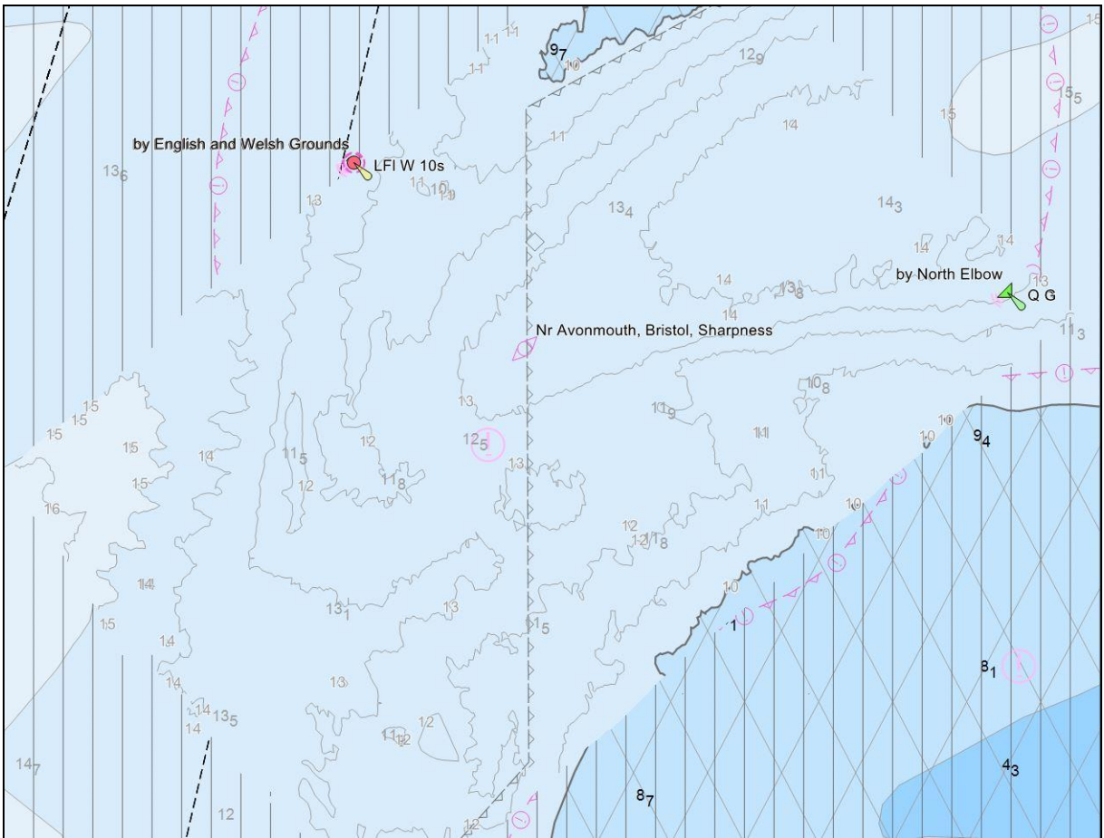
3. Avonmouth 1m contour ENC cell GB601174

The new ENC created for Avonmouth is a berthing cell band 6 which has a 1m contour interval. On the previous harbours ENC when the Mariner selected 11m safety contour the ECDIS defaulted to the next deep contour interval 20m. This makes the area the vessel will have to transit through appear to be dangerous, and would trigger alarms and indications within the ECDIS. However, with our new ENC, Mariners can plan a berth to berth passage using accurate data.