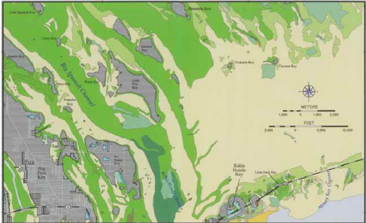
Figure 1 – A map showing benthic habitats near Big Pine Key Florida. Habitats were classified into 24 different types by marine ecologists. Their boundaries were then geo-referenced and incorporated into a GIS database.