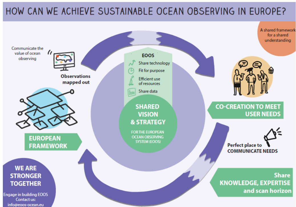
Figure 1: a) The existing challenges and untapped potential of fragmented dispersed ocean observing efforts, and b) The added value of a coordinated European Ocean Observing System framework