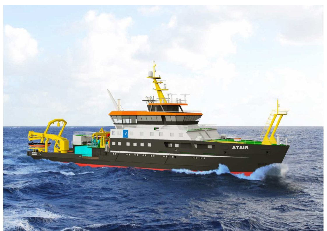
Principle sketch of the new vessel