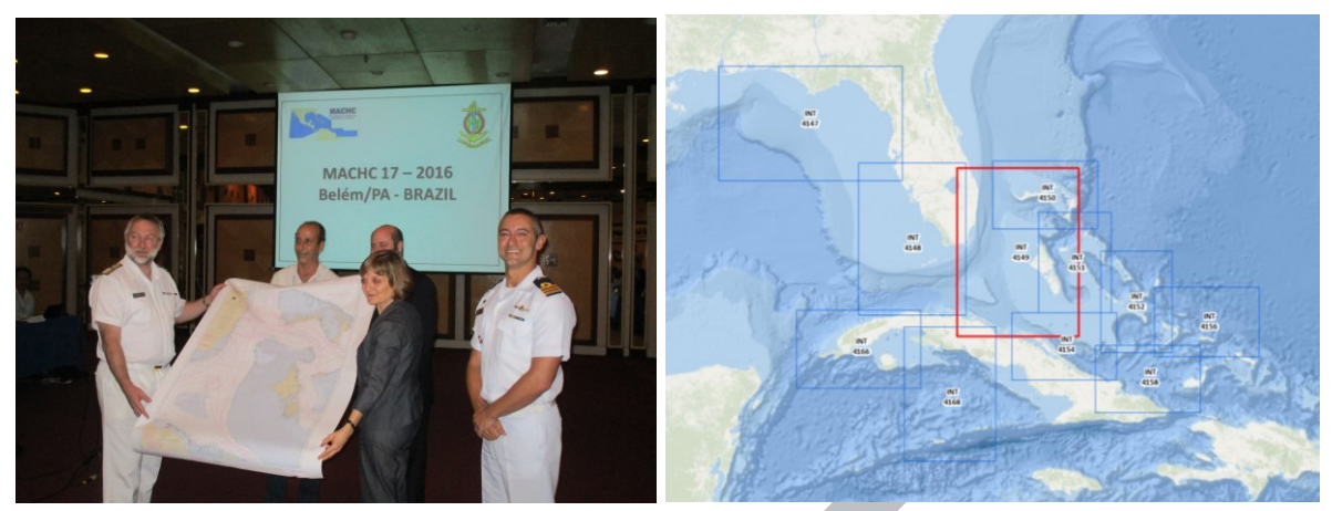
Figures: Presentation of new US/Cuba/UK INT chart 4149.