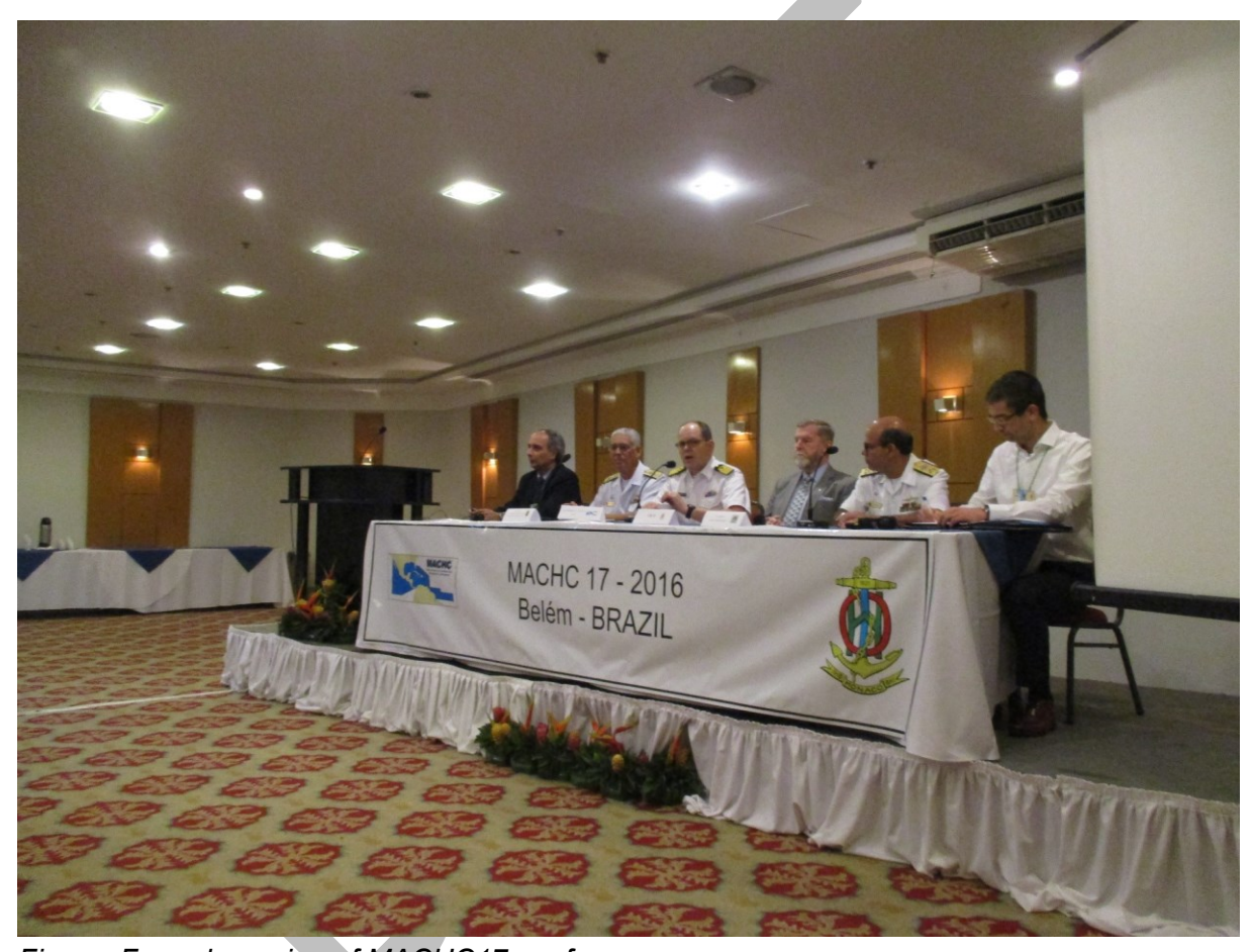
Figure: Formal opening of MACHC17 conference.

The Chair mentioned the excellent hospitality of our Brazilian hosts: last night's Icebreaker provided a good opportunity to start the meeting in a relaxed atmosphere, and there are more social activities during the days to come.