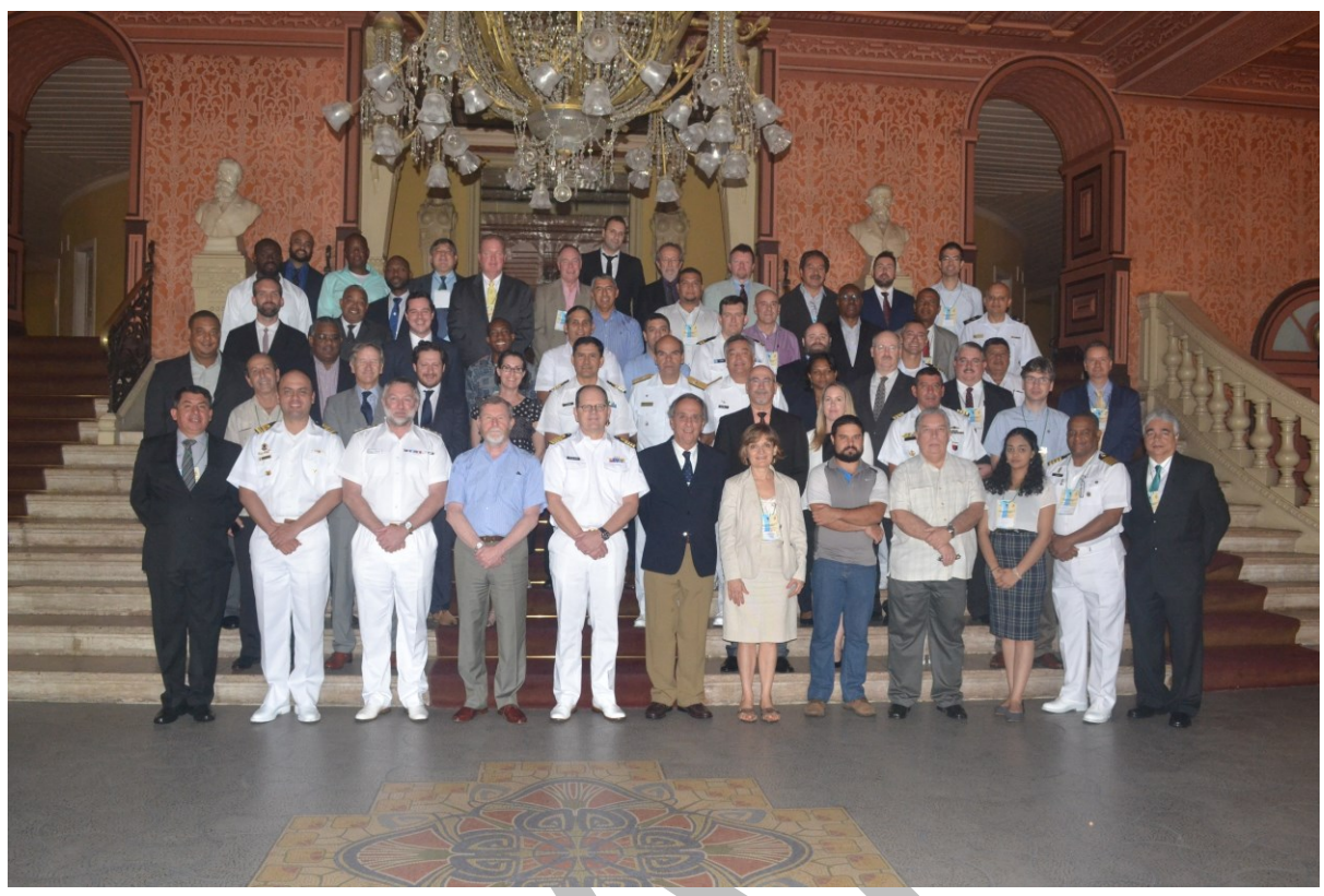
Figure: Participants of MACHC17.