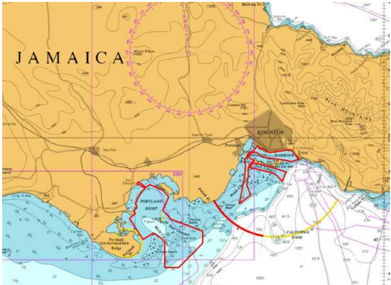
UKHO – CME Hydrographic Survey Areas