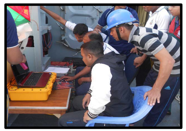
BN Survey Activities