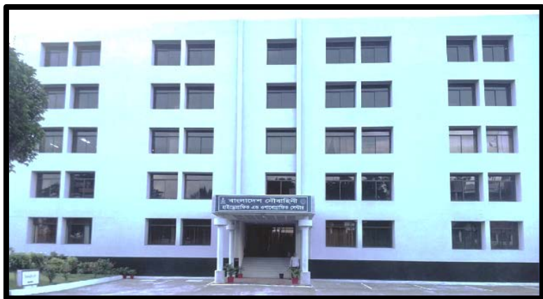
BN Hydrographic and Oceanographic Centre at Chittagong

1.1 Bangladesh Navy Hydrographic Department (BNHD) is vested with the responsibility of hydrographic survey in the coastal and offshore area of Bangladesh. Besides Bangladesh Inland Water Transport Authority (BIWTA) conduct surveys for inland waters. The BNHD consists of a fleet of five survey ships, Bangladesh Navy Hydrographic and Oceanographic Center (BNHOC) and BN Hydrographic School. The Directorate of Hydrography at the Naval Headquarters is the national representative of Bangladesh to International Hydrographic Organization (IHO) and exercise functional authority over BNHD.