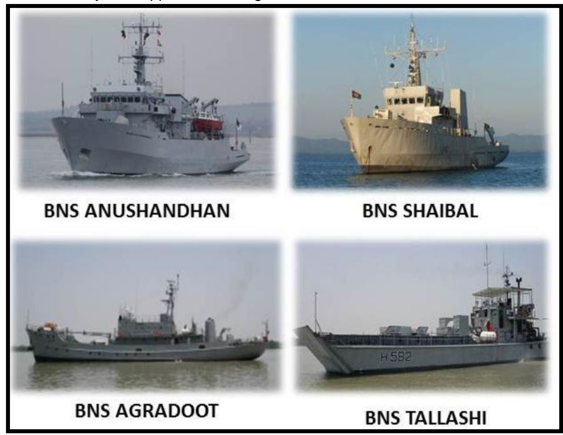
BN Hydrographic Fleet

(Bangladesh Inland Water Transport Authority) and other port authorities have conducted hydrographic surveys at their own area of jurisdiction i.e. ports, harbours and inland waterways to support safe navigation.