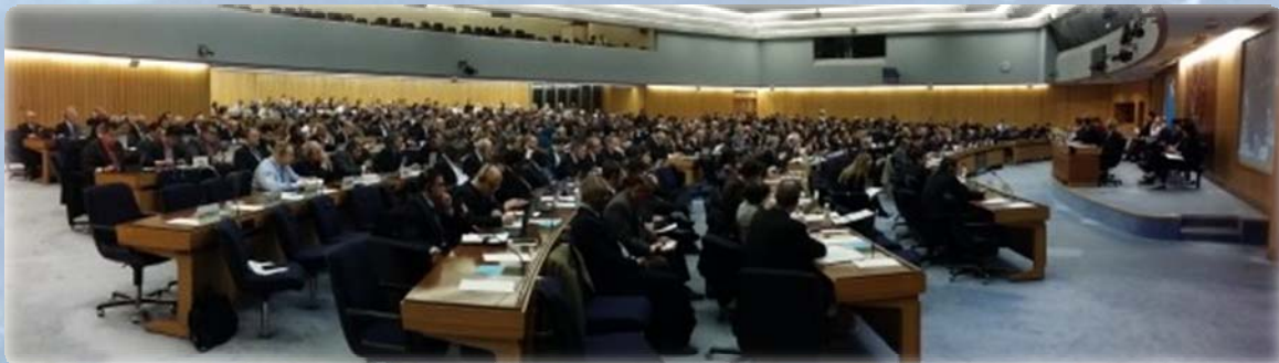
IMO NCSR 6 Plenary in session