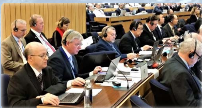
IHO and WMO delegations at IMO NCSR 6

In regard to Communications and Global Maritime Distress and Safety System (GMDSS) matters, the Sub-Committee approved the re-establishment of a Correspondence Group on the modernization of the GMDSS, taking into account the progress on the revision of SOLAS chapters III and IV and on the related and consequential amendments to existing instruments other than SOLAS. The Sub-Committee invited Member States and international organizations to submit