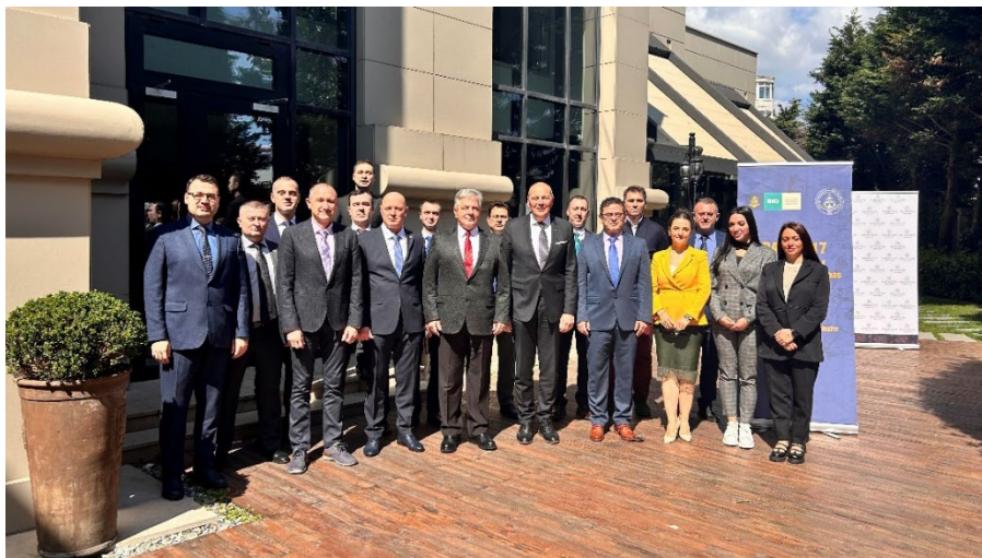
Participants of 17 th Black and Azov Sea Working Group