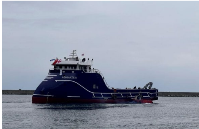
New Georgian hydrographic vessel ABKHAZETI, 34m