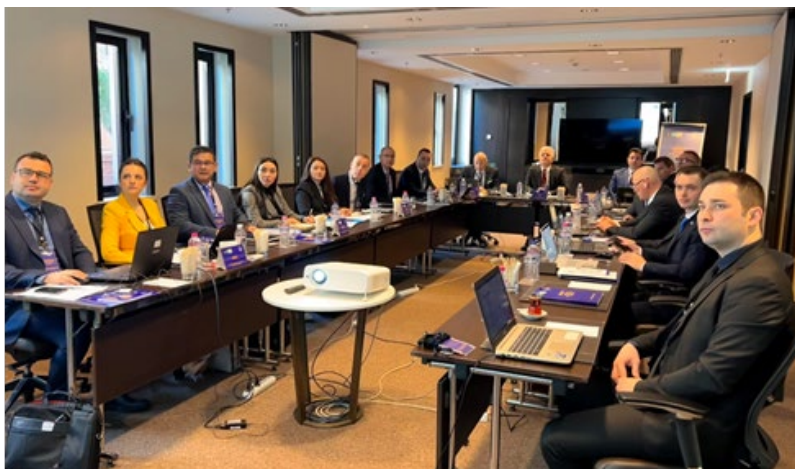
Discussions at the 17 th Black and Azov Sea Working Group

The IHO Director highlighted that a long time has passed since the last in-person meeting held in Constanta (Romania) in May 2018. From that time, new challenges await the WG, first of all, the implementation of the S-100 standard, which is now a reality that will become effective from 1 st January 2026. By that date, the entire community of the Mediterranean and Black Sea Region will have to be ready in line with the S-100 implementation roadmap prepared by the IHO and thanks to the support of all the stakeholders working in support of the S-100. The Working Group allows the six Countries to highlight peculiarities and needs of a specific Region, the Black and Azov Sea, of high interest not only for the IHO, but also for other international organizations working on the sea and for the sea, in such difficult time which the Black and Azov Sea Region and especially the State of Ukraine are living. Furthermore, he highlighted the main cooperation activities undertaken by the IHO internationally and with IHO Member States, the most important outcomes of C-7, with particular focus on the implementation of S-100 Roadmap, Capacity Building and the revision of the IHO Strategic Plan.