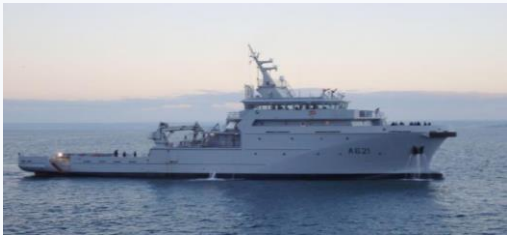
Morocco: Dar Al Beida