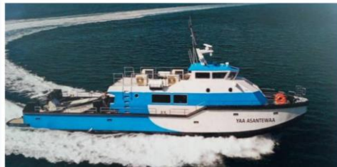
Ghana: Yaa Asantewaa