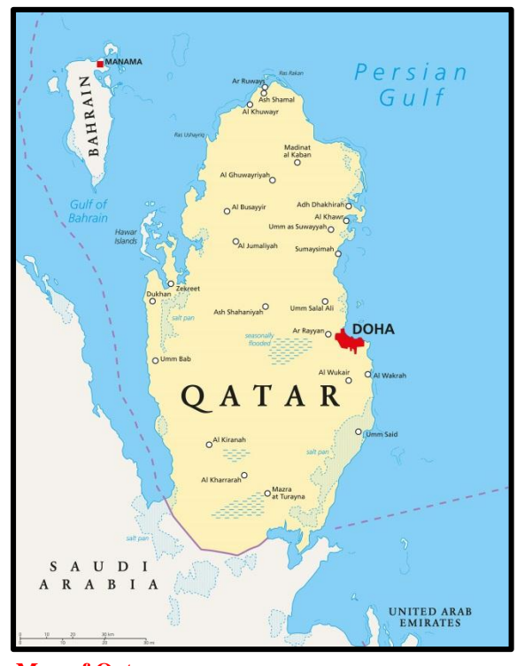
Map of Qatar

Qatar is known to be a young, developing, exciting and a place of opportunities for all. The capital city of the State of Qatar is Doha located on east side of the coastal state. It is a mixture of business, family values, up-to-date technology, multinationalism and most importantly rich in culture. Qatar is investing in different sectors in order to increase the diversification of its economy and reduce its reliance on natural resources. This is being achieved by investing in education and human capital in order to fulfill the needs of different specializations in multiple sectors. The nation is aiming to excel in education, technology, health, sustainability and commerce. Hence, the Qatar National Vision 2030 was created in order to achieve the desired missions to the maximum potential. The main segment of the national vision is to convert the nation to a knowledge-based economy by investing in education, research and technology.