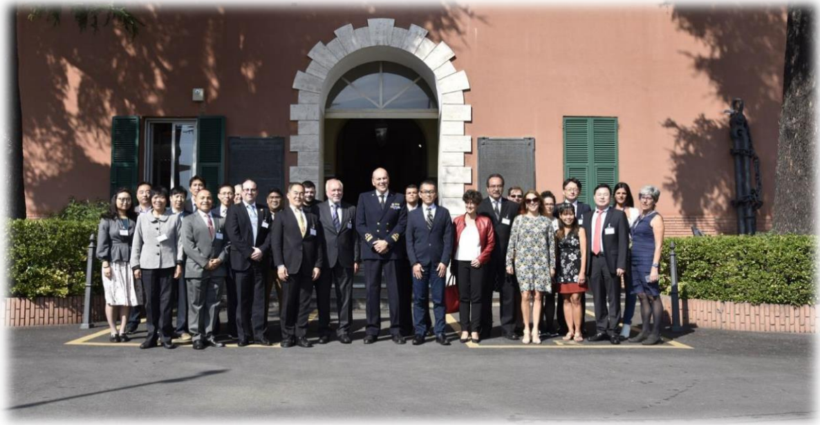
Participants of the SCUFN-30 meeting

new technologies offer more possibilities, limit the clutter in mapping, and improve consistency with associated existing features.