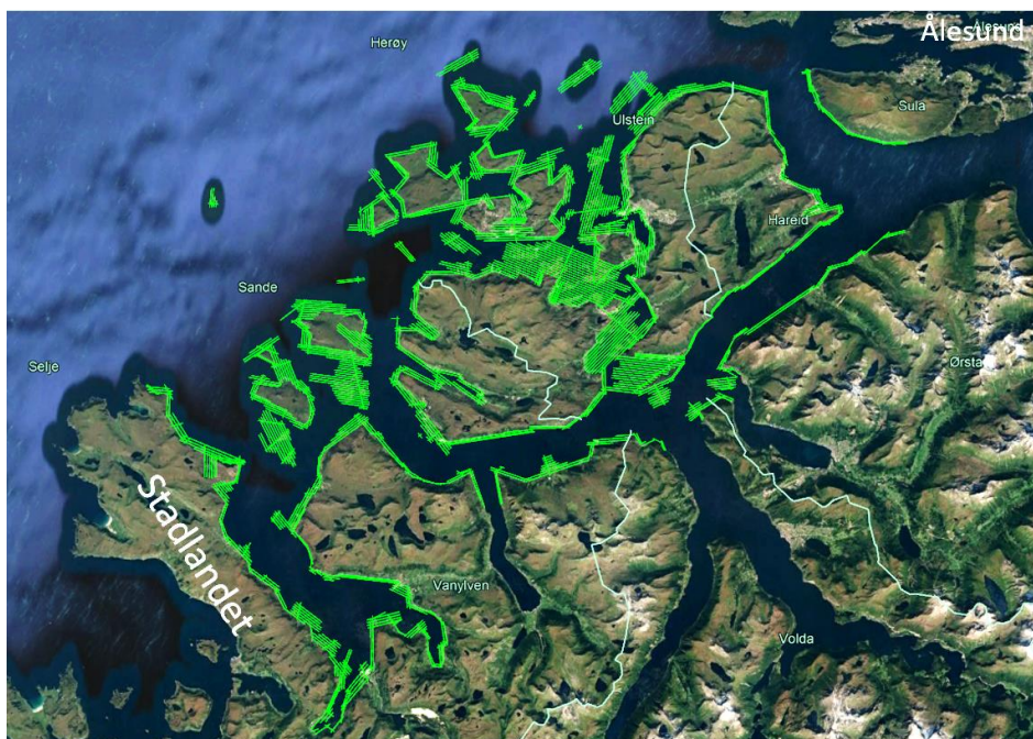
Figur 2: The survey area south west of Ålesund