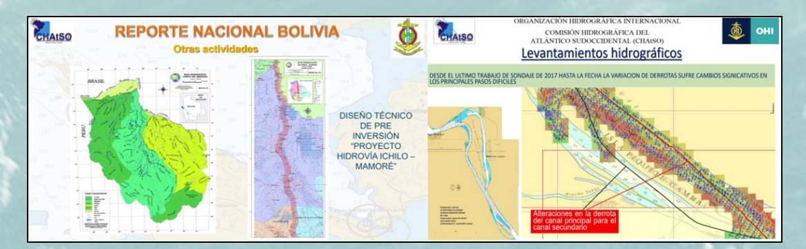
Waterways surveys in South West Atlantic Region

Following the report on the last WWNWS meeting, Argentina, as NAVAREA VI coordinator expressed the concern, fully shared by Brazil, about the mandatory implementation of the new IridiumSafetyCast satellite system, highlighting not only problems related to the costs of the new system, but also to possible errors in the transmission of MSI information. This concern will be represented at the next Council-6 by the IRCC Chair, on behalf of the RHCs.