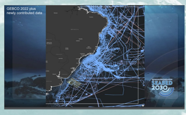
2022 SWAtHC's contribution to GEBCO

During the meeting an update on the activities of GEBCO, Crowd Source Bathymetry (CSB) and Seabed2030 was provided by the CSB/GEBCO/Seabed2030 Regional Coordinator, highlighting that the coastal States of the Region actively contribute to the GEBCO programme, through the regular submission of existing bathymetric data in national databases and new data from hydrographic campaigns. Argentina, Brazil and Uruguay committed to responding within the deadline to IHO CL 25/2022 regarding the approval of the new Edition 3.0.0 of IHO Publication B-12 - Guidance for Crowdsourced bathymetry, and