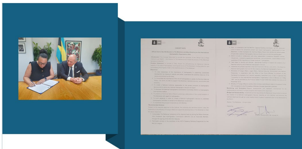
IHO Director and MFA Director General signing the "Concept Note"

At the end of the individual meetings, the intention of the Bahamian authorities to support the internal process for joining the IHO was confirmed at all levels, as well as the intention to start the familiarization with the hydrographic community through the participation at the MACHC works as Associate Member. It was also agreed that the IHO Secretariat will continue to follow and support the Bahamian authorities along the next procedural steps to join the IHO, providing all the necessary assistance.