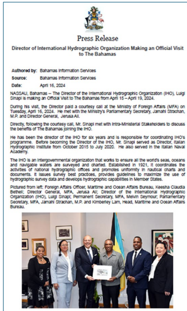
Press release from the Bahamas Information Services

The discussions were focused on the role of Hydrography, IHO and Meso-American and Caribbean Sea Hydrographic Commission (MACHC) in the sustainable development of the Caribbean Ocean economy, the importance of Hydrographic Services at national, regional and international levels, and their role in the sustainable development of national economies, with reference to the economy of The Bahamas and the opportunity to improve the current Maritime National Policy.