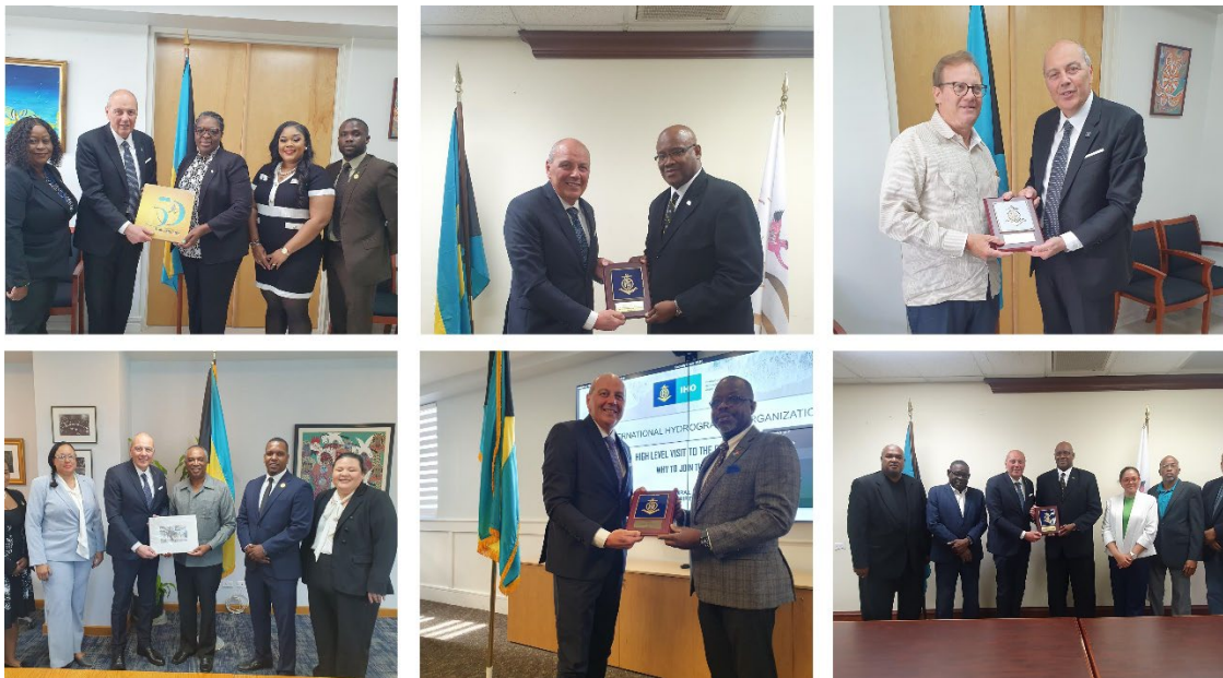
IHO Director visiting the Bahamian Ministries of Foreign Affairs, Legal Affairs, National Security and Environment and Natural Resources