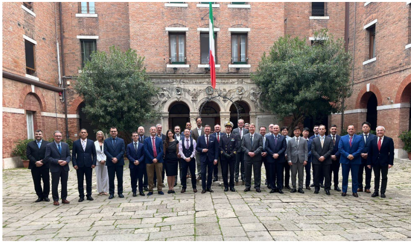
Participants in HCA-19, in-person and VTC