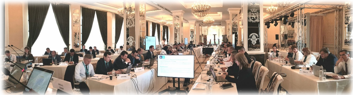
Participants in session at the 24 th Conference of the MBSHC – Figure 1

The Conference was preceded on 1 July, by successive working sessions led by the Chairs of the MBSHC Working Groups, aiming to finalize the recommendations and proposed actions to be presented at the plenary Conference for decision if appropriate.