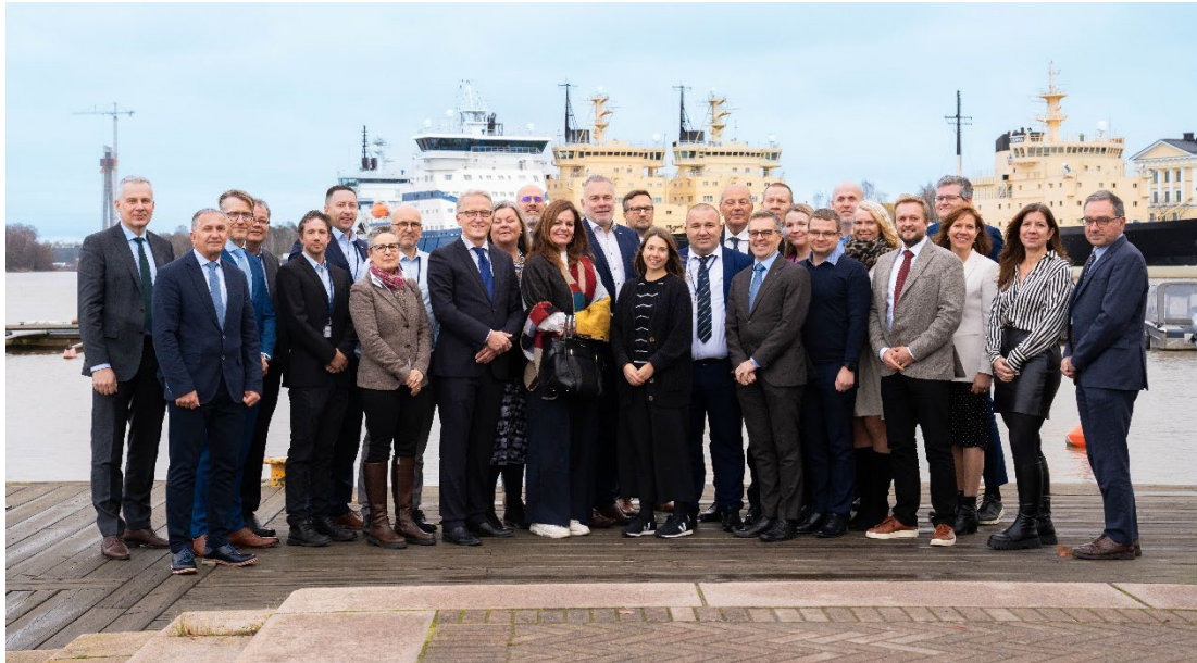
PAC31 participants – 12-14 November, Helsinki, Finland