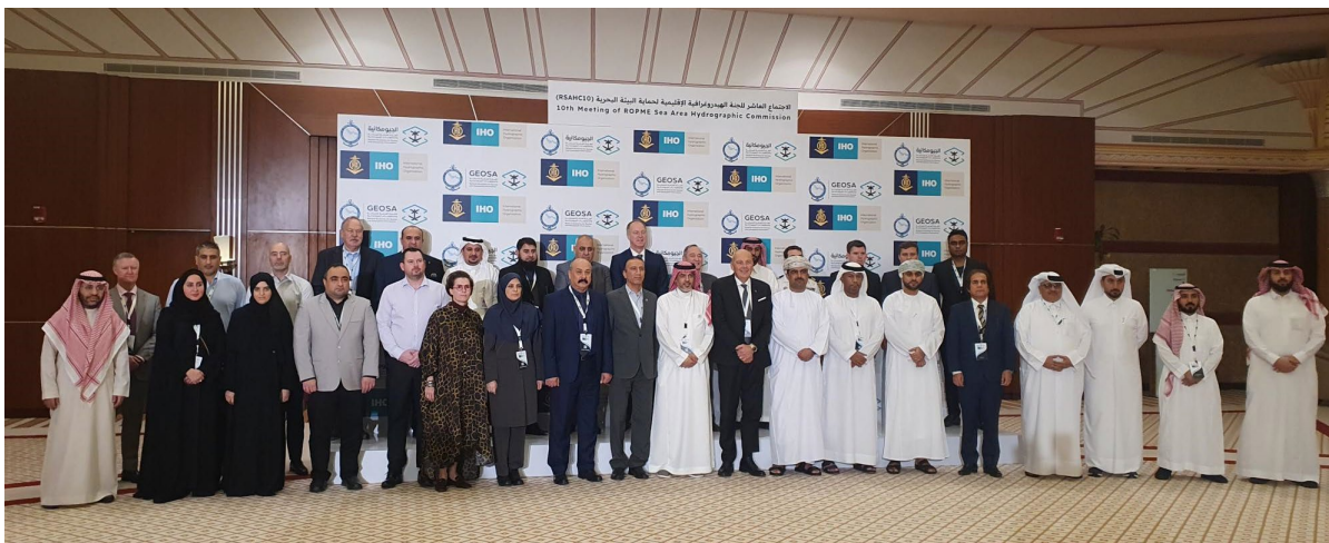
10 th ROPME Sea Area Hydrographic Commission – RSAHC10 participants – Jeddah, Kingdom of Saudi Arabia