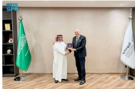
IHO Director and President of GEOSA, Riyadh, Kingdom of Saudi Arabia, 25 November 2024

Discussions between the IHO Director and the President of GEOSA were focused on the following topics: