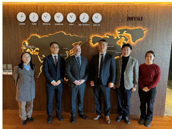
Figure 1: IHO-KHOA Technical Coordination Board