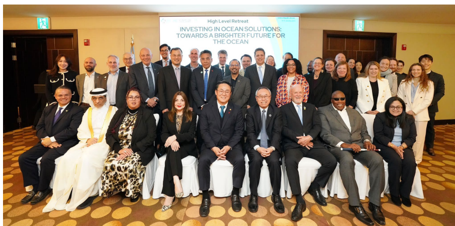
High Level Retreat participants – 14-15 January 2025 – Incheon, Republic of Korea