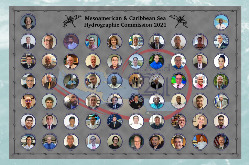
Some participants at the MACHC21 Meeting

The 21<sup>st</sup> Meeting of the Meso American & Caribbean Sea Hydrographic Commission (MACHC21), initially planned to be held in New Orleans (USA), was held in a VTC format due to the COVID-19 pandemic from 30 November to 3 December 2020.