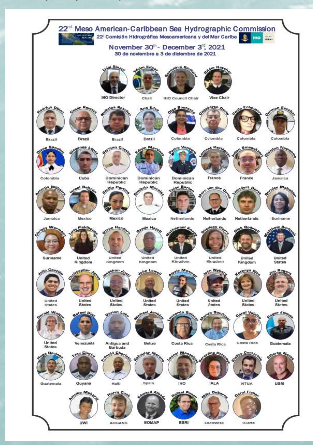
Participants of the MACHC22 Meeting

The next MACHC23 will be held in the week of 28 November to 02 December 2022 (dates and place to be confirmed by July 2022).